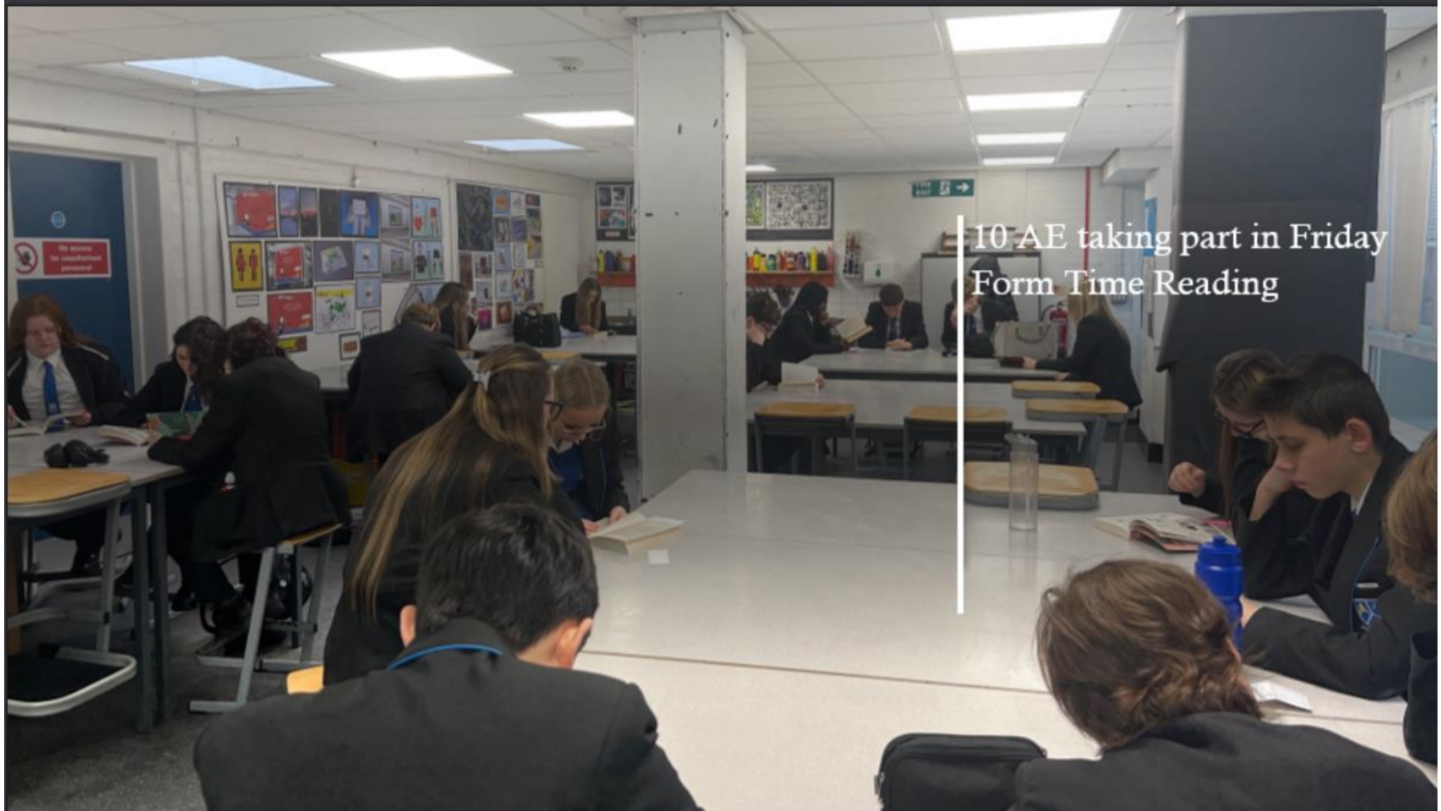
10 AE taking part in Friday Form Time Reading